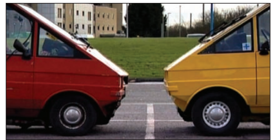
Elegy for the Elswick Envoy, Documentary Shorts I

Some of the best dramatic films submitted to the festival can be found in this block. A wonderful mixture of serious and touching films will be seen - some that make you think, some that do the thinking for you. If you enjoy dramas, this is a great block to attend!