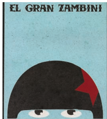
The Great Zambini, Dramatic Shorts II

A collection of graduate and undergraduate college films from Florida and Illinois, plus two professional short films. Professional films consist of an animated short and an experimental short.